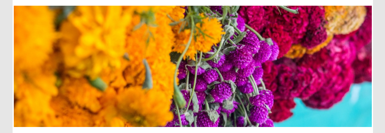
2025 Forbes | SHOOK Best-in-State

With Spring in full bloom, we have a few updates we would like to share. Please feel free to reach out to us if you would like to discuss any of our Spring Updates.