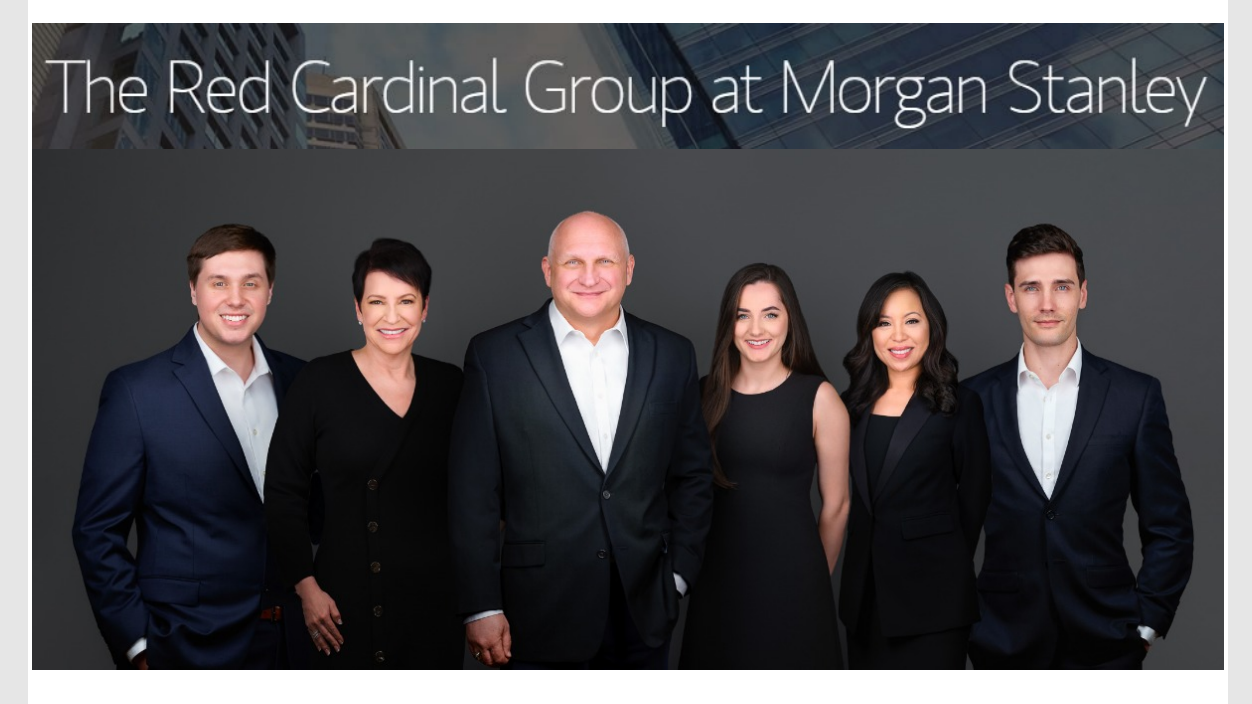
From Our Team

The Red Cardinal Group at Morgan Stanley