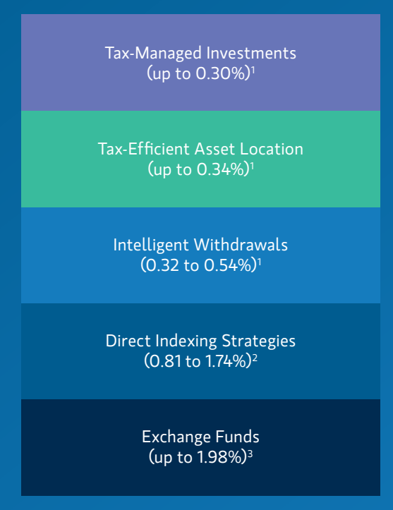
Figure 2. Average Incremental Annual Return Potential

For illustrative purposes only. The above hypothetical analysis compares a base portfolio that assumes a 7.5% annual return with two other portfolios with reduced annual returns of 6.5% and 5.5% over a 20-year period. The portfolios with reduced returns are meant to demonstrate the long-term effects of even a small amount of compounded annual return loss due to tax-inefficiency. Actual results may be influenced by more complex factors.