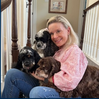
Lee, Sophie, Flynn, and Paisley

In honor of National Pet Day celebrated on April 11th, we'd like to share the furry companions of the Capital of Texas group!