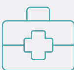
Health and Wellness