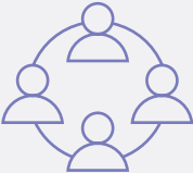
Diversity, Equity and Inclusion