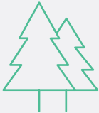
Conservation and Biodiversity